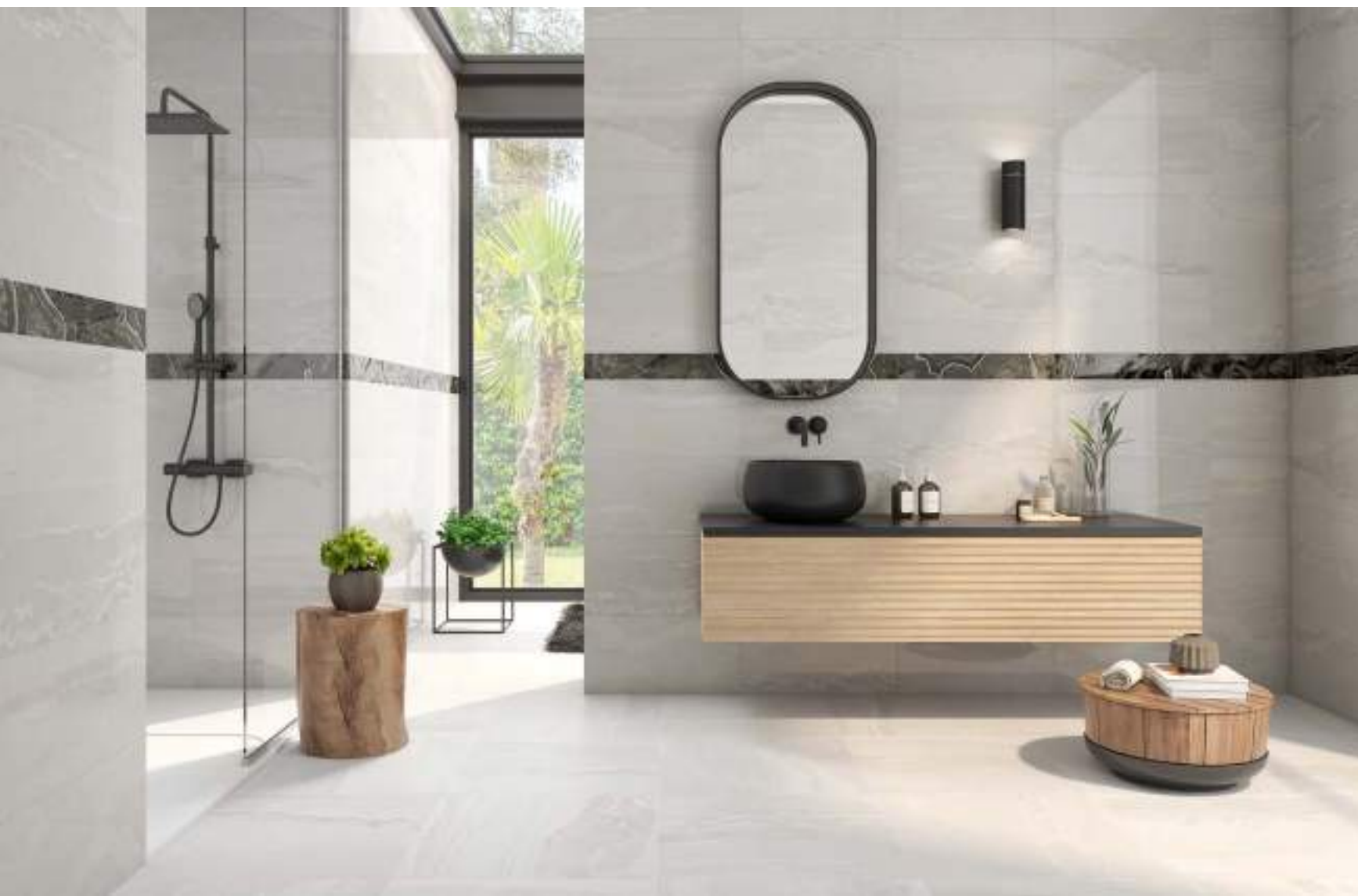
Rvto. / Wall / Rvrtm: Cr. Whitehall Pearl 30x60 Leviglass – Cnf. Opal Coal 9,5x60 Pvto. / Floor / Sol: Cr. Whitehall Ash 60x60 Compacglass Rectificado